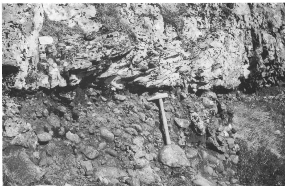
Figure 3.6: Boulder conglomerate underlying flow-banded icelandite lava flow. The conglomerate contains granophyre, felsite and allivalite clasts derived from the weathering of the Rum Central Complex. South side of Fionchra. Fionchra site, Rum.