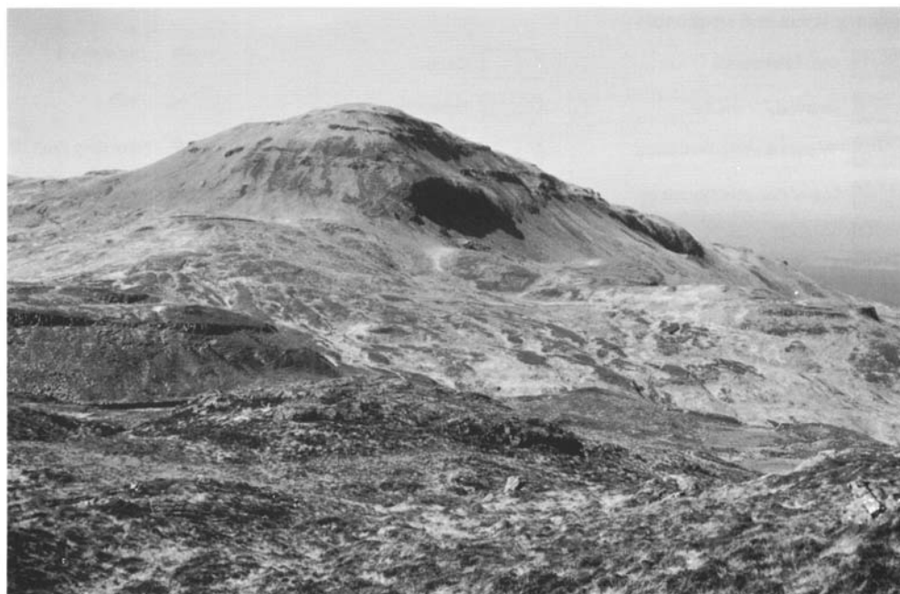
Figure 3.5: Post-Central Complex basic lavas resting on an irregular surface of Torridonian sandstone. Fionchra site, Rum.

The lavas and associated sediments were first described by MacCulloch (1819). Judd (1874) correctly deduced their age relative to the plutonic rocks. However, Geikie (1897) and Harker (1908) both considered them to be relicts of a once extensive plateau embracing all the Small Isles subsequently intruded by the Rum Central Complex. Harker also frequently misinterpreted the massive flow interiors as intrusive sheets or sills (see site descriptions for northern Skye). Tomkeieff (1942) reinterpreted Harker's sills as trachyandesitic lava flows and, together with Bailey (1945), considered them to be of a pregranophyre age.