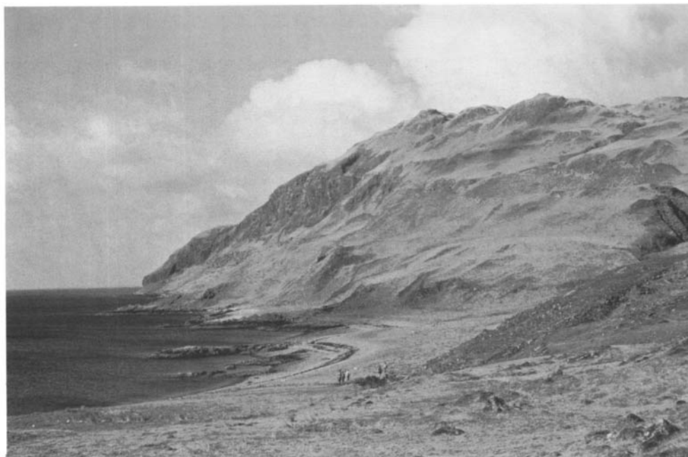
Figure 4.3: Ben Hiant from the east, showing terracing developed along the location of minor intrusions. The headland to the left is Maclean's Nose, formed by volcanic breccias. Ben Hiant site.

mushroom-shaped body in part and also an assemblage of coalesced sheets. The rocks which form the successive terraces vary slightly in chemistry (Gribble, 1974; Gribble et al. , 1976) and modal mineralogy (Gribble et al. , 1976, confirming Judd, 1890). Gribble (1974) has argued that the intrusion is not a single homogeneous body and it is possible that several pulses of magma were responsible for the intrusion, the problems that it poses not yet having been resolved.