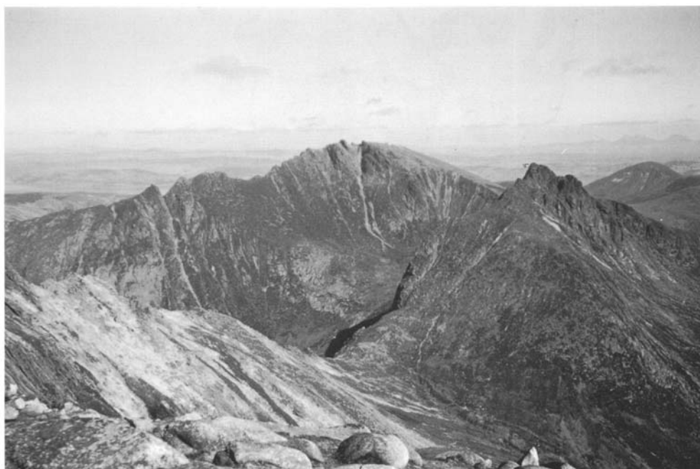
Figure 6.1: The Northern Granite Mountains of north Arran. Cir Mhor, Arran.

The north-western part of the Northern Granite and adjoining updomed and metamorphosed Dalradian metasediments lie within this site, which includes the glacially eroded and deepened Glen Catacol and much of the higher ground of the Bheinn Bharrain-Meall nan Damh ridge. Two distinct biotite granites comprise the Northern Granite, a coarse-grained Outer Granite often in chilled, intrusive contact with the Dalradian, and a younger fine-grained Inner Granite which has sharp intrusive contacts towards the Outer Granite. The Outer Granite forms the spectacular mountainous scenery of northern Arran (Fig. 6.1), whereas the Inner Granite is less resistant to weathering and is characterized by lower, more rounded hills. Granite–granite and granite–metasediment contacts are generally steep, a feature well displayed within the site which has over 700 m of relief. Post- and pre-granite basaltic dykes and post-granite felsitic dykes also occur throughout the site.