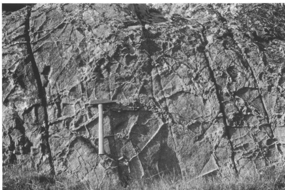
Figure 4.8: Granitic net-veining and an intrusion breccia of gabbro and dolerite fragments. Centre 2 ring-dykes, near the lighthouse, western tip of Ardnamurchan.

The area between the lighthouse pier (NM 423 675) and Eilean Carrach contains superb exposures of the granophyric Quartz Dolerite of Sgurr nam Meann. In this area, porphyritic dolerite roofs a complex intrusion of aphyric dolerite and granophyre. From place to place, the granophyre varies from being volumetrically dominant to subordinate; small-scale anastomosing veins which cut both dolerites can be traced to sheet-like acid masses which contain a varied assemblage of basic rock types as inclusions (Figure 4.8). The inclusions frequently exhibit fine-grained, crenulated, chilled edges against the enclosing granophyre. Further to the north, the quartz dolerite contains several large, raft-like masses of Hypersthene Gabbro and steeply dipping contacts between the Dolerite and Hypersthene Gabbro are exposed south of Eilean Carrach. Eastwards, the granophyric Quartz Dolerite of Sgurr nam Meann is bordered by a narrow outcrop of the Quartz Gabbro of Loch Caorach, which in turn adjoins an augite-rich variety of the Eucrite of Beinn nan Ord containing felsic veins bearing fine-grained basic xenoliths. The contact relationships of these intrusions have not been convincingly demonstrated.