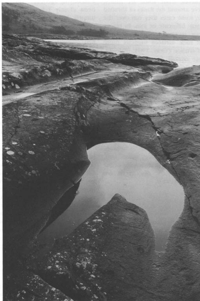
Figure 11.6: P-form channels at Scarisdale, Mull.

Channel sides vary from very gently sloping to vertical or even undercut. A particularly good example of undercutting (site 2) has a depth of 0.05 m, but the deepest undercut (site 3) is 0.1 m high. Asymmetrical cross-profiles are common, with the south (inland) slopes usually being the steeper. Most channels have rounded upper edges, although in several places sharp edges occur.