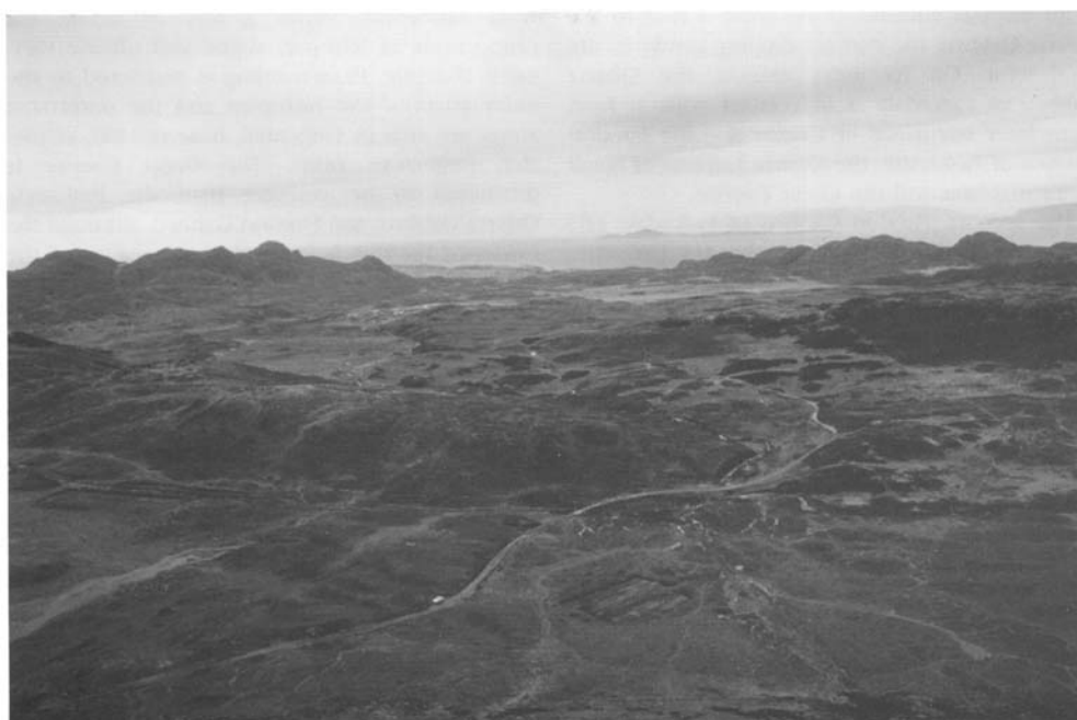
Figure 4.10: The natural amphitheatre of Centre 3, Ardnamurchan. The imposing arcuate ridges in the distance are formed by the Great Euclite.