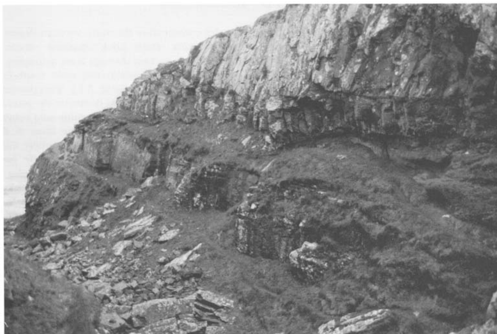
Figure 5.7: The best section through the Ardtun Leaf Beds at Siochd, an Uruisge (NM 377 248). Ardtun site, Mull.

The coarser-grained sediments are rich in angular quartz grains and derived flints and silicified chalk pebbles are abundant in the conglomerate. Pebbles of porphyritic igneous rocks are also present which may be of Palaeocene age and derived from nearby flows, or of Lower Old Red Sandstone age (Bailey et al. , 1924); conclusive evidence for their source is lacking.