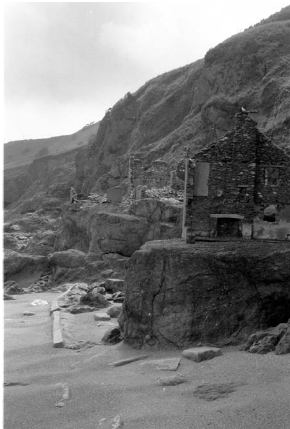
Figure 6.10: The ruins of the landward row of the houses of the former village of Hallsands. The seaward row of houses has completely disappeared. Compare with Figure 6.9.

Hails (1975a) also questioned whether the village had been constructed on bedrock that was sufficiently resistant to withstand storm wave attack. Robinson (1961) reported that at the Coastguard Cottages the cliff top retreated almost 7 m between 1907 and 1961, commenting that there had been a surprising amount of cliff recession. The schists possess many structural features that weaken the cliffs, and the sea has exploited these weaknesses. To the south of Wilson's Rock, however, there has been substantially less general cliff retreat. Mottershead (1986) described the tendency of houses that had been built on the sediment-filled clefts to collapse during storms, and demonstrated the variable strength of different parts of the village site. Nevertheless, the bedrock exhumed from beneath the shingle shows considerable resistance to erosion. The importance of this site is based on the following: