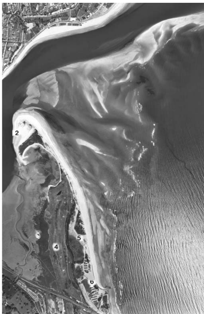
Figure 8.11: Aerial photograph of Dawlish Warren with the main geomorphological features numbered. 1 = Exe estuary, main channel; 2 = active recurved distal end (Warren Point); 3 = saltmarsh; 4 = inner spit (largely modified); 5 = outer spit; 6 = proximal end coastal protection works; 7 = intertidal sandbanks; 8 = prevailing and dominant wave direction (from the south-east).

The spit appears to have existed in its present-day position on the western side of the Exe estuary since at least the 16th century. Martin (1893) was unable to confirm local reports that at one time it extended across the estuary from the eastern shore at Exmouth. Throughout its documented history (i.e. since 1869) Dawlish Warren has been undergoing erosion. The Outer Warren has been breached frequently and the shape of Warren Point changed considerably. When high spring tides are accompanied by south-easterly gales driving high onshore waves, the lowest part of the ridge is overtopped and breached. The breach is subsequently rebuilt as waves from the south and south-west move sand along the spit and extend it. At the same time the face of the beach and dunes is eroded and so the spit retreats. Sand is also blown from the dune ridge towards the distal end. Sand eroded from Warren Point may be transported into the estuary or may travel towards the Pole Sands. Kidson (1964b) pointed out that erosional phases at Warren Point were not associated with any increase in the volume of sediment in the Pole Sands. The interplay of different wave directions has produced a highly dynamic form.