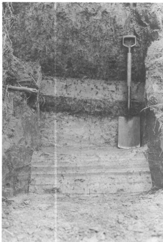
Figure 14.5: Section at Maryton. Laminated Late Devensian marine clays are overlain by peat then a layer of grey, micaceous, silty, fine sand interpreted as a tsunami deposit. Above the latter is silty peat then carse clay.

and reached an altitude of 15 ft (4.6 m). Shells similar to those found in the present-day estuary were locally abundant in the carse clay. Details were given by Jamieson (1865) and Howden (1868). More recently, the pattern of Holocene sea-level changes in the Montrose area has been investigated in detail by Crofts (1971, 1972, 1974) and Smith and Cullingford (1985). In particular, Maryton has been described in detail by Smith et al. (1980). A sequence of marine and non-marine organic deposits infills a number of gullies dissecting Late Devensian marine and glaciofluvial terraces at the western end of the Montrose Basin (Cullingford and Smith, 1980; Smith et al. , 1980). A section in a terrace bluff at Maryton shows (Figure 14.5):