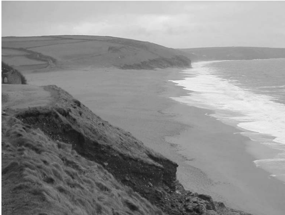
Figure 6.5: Loe Bar, looking approximately south-east, showing the bar and its washover features.