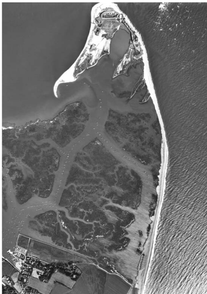
Figure 6.22: Aerial photo of Hurst Castle spit. 1. Distal end of modern beach; 2. Groynes protecting Henrician (16th century) castle; 3. and 4. earlier recurves; 5. saltmarsh – the seaward edge of saltmarsh is undergoing retreat; 6. Spartina anglica -dominated saltmarsh, declining in area; 7. coastal defences at Keyhaven; 8. most commonly overtopped and artificially rebuilt section of beach ridge; 9. waves approaching from south-west. For discussion of the saltmarsh features, see GCR site report in Chapter 10 for Keyhaven Marsh.

changed, the rate of drift would increase. Shingle would move rapidly around Hurst Point, but travel more slowly along the recurves. As water depth increased, more shingle would have been required to extend the spit. Refracted waves would move some shingle along the recurves, while north-east waves in the Solent with their longer fetch could build up the ridges. The distinctive sharp angle at Hurst Point (Figure 6.22) is the result of the main ridge-building waves being restricted by the shelter of the Isle of Wight to two main directions, the south-west and the north-east.