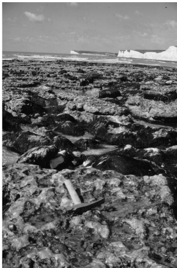
Figure 4.28: Detail of the chalk and flint platforms east of Birling Gap.

Although the platforms along this coast have been commonly described as erosional features, little account has been taken of the role of the flint bands in controlling the micro-relief. Thus although there is an accordance of heights along the platform, the platform is a series of gently sloping micro-cuestas (Figure 4.28), with scarps on their western side at a point where the undercutting of the underlying chalk brings about collapse of the flint cap.