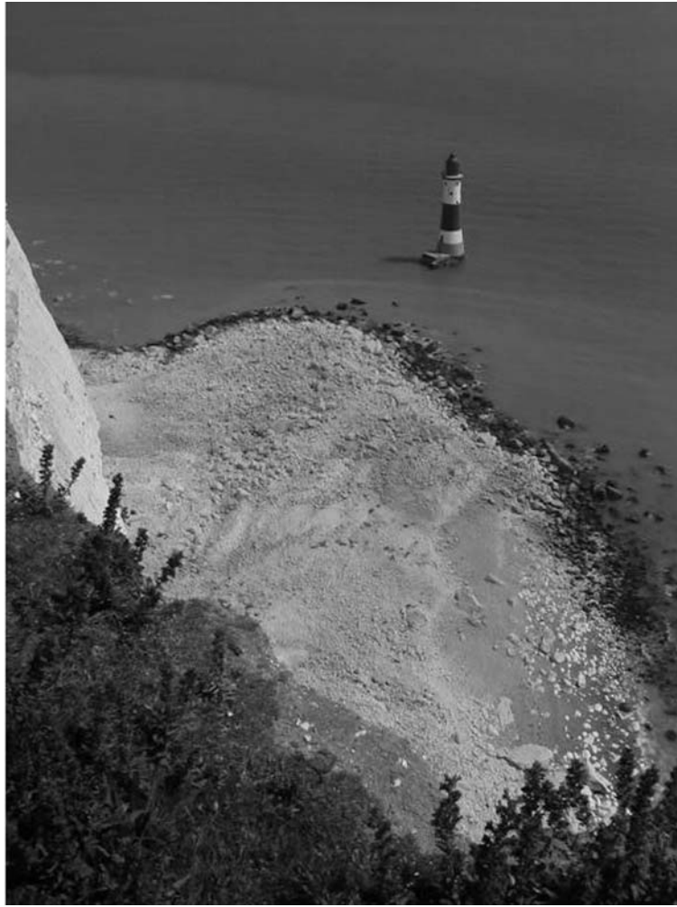
Figure 4.26: (a) Beachy Head, cliff top view looking east, the cliffs are characterized by slab failures in the lower cliff that gradually undermine the upper cliff. (b) Cliff collapse at Beachy Head, early 1999; the failure affected the whole cliff face and produced a very large debris area at the cliff foot.