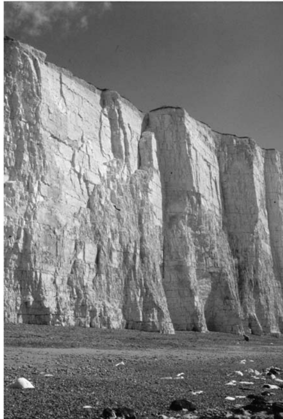
Figure 4.27: Relationships between joints, cliff morphology and retreat near Birling Gap.