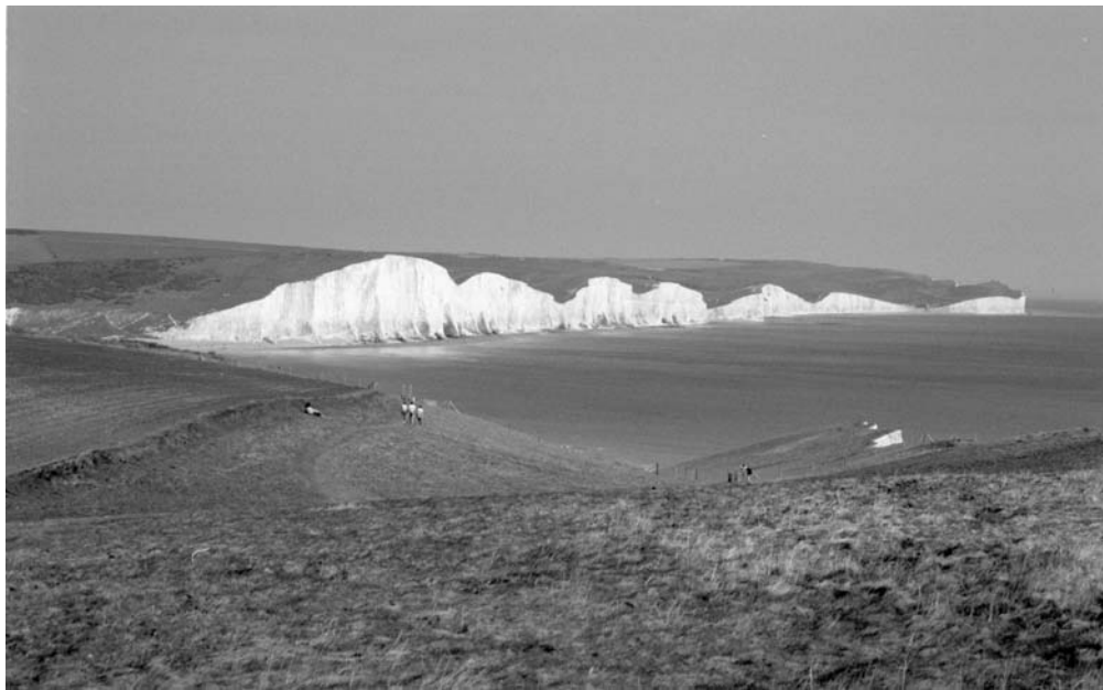
Figure 2.9: Cliff height, and to some extent cliff form, is a function of the height of land cut by the cliffline. The photograph shows the cliff form of the Seven Sisters, Sussex, an almost straight cliffline truncates a series of dry valleys, the seven intervening ridges forming the Seven Sisters.