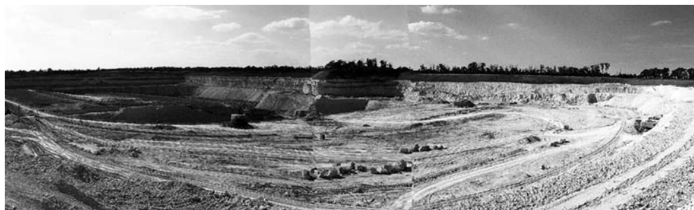
Figure 4.23: Barrington Chalk Pit, Cambridgeshire: a classic locality for the Cambridge Greensand and Totternhoe Stone. Photomosaic: R.N. Mortimore.)