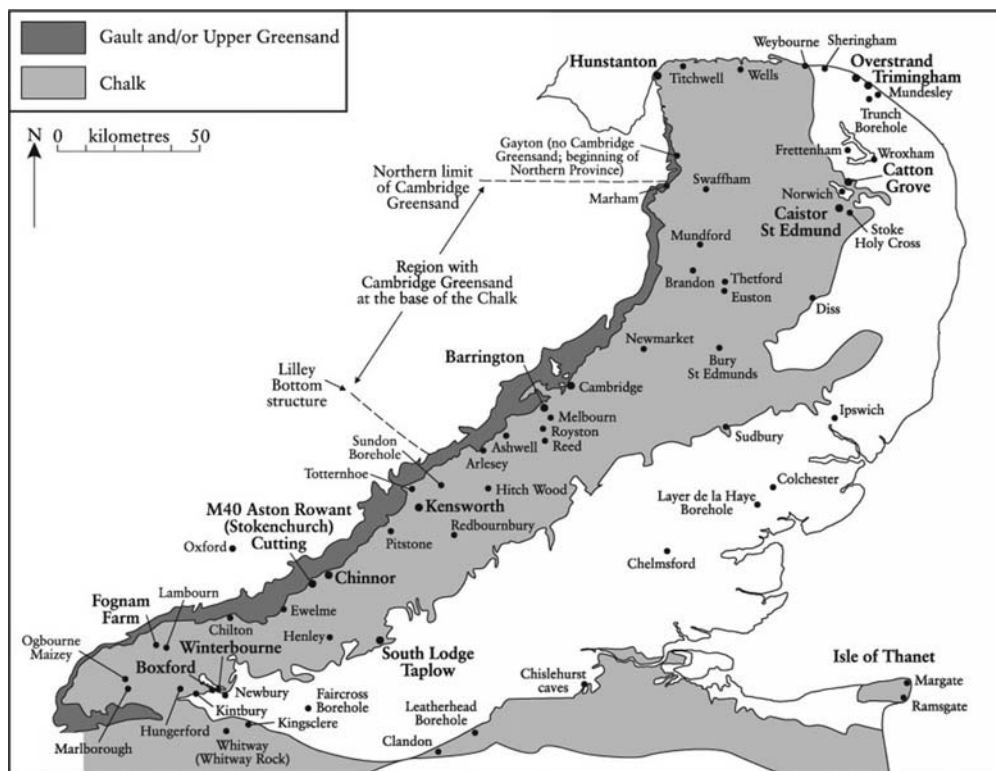
Figure 4.1: Location of GCR sites (bold type), and other sites also mentioned in the text, in the Transitional Chalk Province of England.

The Cambridge Greensand has long been famous for its fossils. The large numbers of these fossils, particularly ammonites, housed in museum collections – most importantly the Sedgwick Museum, Cambridge and the British Geological Survey, Keyworth – give a completely misleading impression of their relative abundance. In fact, most of the fossils were collected from piles of excavated sediment left to dry in the sun on the edges of the flooded coprolite pits. The proportion of collectable macrofossils to shapeless phosphatic nodules is actually extremely low, this being particularly the case both at Barrington Chalk Pit and also at the other extant exposure at Arlesey Pit, north of Hitchin (TL 1879 3476) (see Hopson et al. , 1996, pp. 34–35 and fig. 9; and Figure 4.1). Ammonites have always been extremely rare here, but there is evidence from museum collections that other sites nearer Cambridge were more fossiliferous.