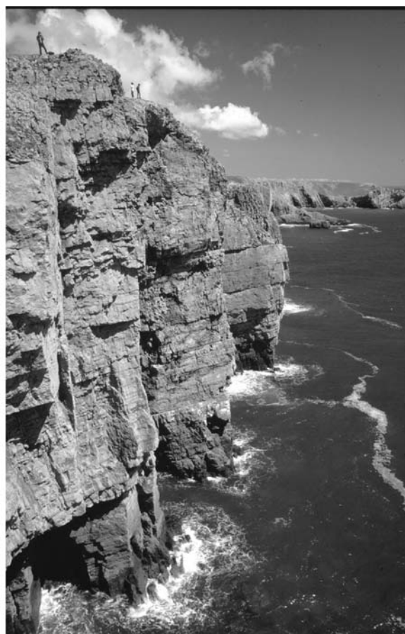
Figure 3.30: Cliff profiles, South Pembroke Cliffs GCR site. Cliffs are steep, near-vertical and occasionally overhang where the dip is to landward.

generally attributed (John, 1978) to marine erosion during Pliocene or early Pleistocene times. At the coastal edge, the structures of the Carboniferous Limestone are truncated not only by the cliffs, but also by this well-developed erosion surface. The dip of the Carboniferous Limestone exposed in the cliffs varies from landwards, west of the Devil's Cauldron, to seawards, east of Flimston Bay. Cliff forms that are steep, near-vertical and occasionally overhang, where the dip is to landward (Figure 3.30), are replaced by cliffs that are much gentler in profile and where the seaward-dipping beds largely control the cliff form. Much of the cliff foot is marked by a jumble of boulders from both recent and older rock falls.