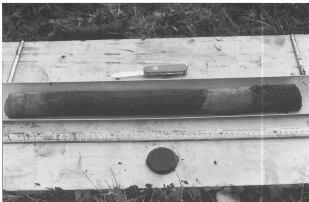
Figure 13.12: Core from the basal sediments at Tynaspirit. From the left, the sequence comprises Late Devensian minerogenic sediments, organic Lateglacial Interstadial sediments, Loch Lomond Stadial silts and clays, and early Holocene organic lake muds.