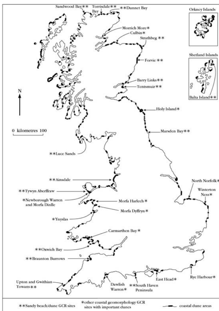
Figure 7.1: Great Britain sandy beaches and coastal dunes, also indicating the location of GCR machair-dune sites (see chapter 9) and other coastal geomorphology GCR sites that contain dunes in the assemblage.

Marsden Bay (see Figure 7.1 for general location) includes beach, rock and cliff features and is a classic locality for beach process studies, based on the work of C.A.M. King over 50 years ago (King, 1953). Until very recently, it was the only site where the behaviour of beaches resting against relatively resistant cliffs had been studied intensively. King's analysis of the relationship between beach profiles and wave conditions influenced much subsequent work on beaches, and as a result, the location is frequently cited in the literature. It is also notable for a suite of cliffs and shore platforms cut into the Permian Magnesian Limestone, which crops out only on this part of the British coast between the River Tyne and the River Tees, and it contains the best examples of the stack and cliff development in this rock type. The Permian concretionary limestone is most common in the headlands, stacks and arches, whereas the bays are cut into a weaker dolomite. An intricate assemblage of forms has developed as local small-scale joints have been exploited by marine erosion. Although Marsden Beach itself is dominated by sand with some shingle, there are also cobble and boulder accumulations associated with both the cliff-foot and former stacks. This site remains better documented than any of the other small cliff-foot beaches that occur along the north-east coast of England.