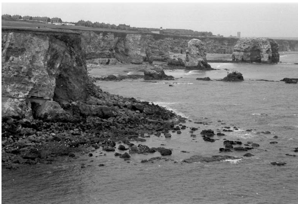
Figure 7.3: Marsden Bay – view looking towards the north-west showing the Magnesian Limestone cliffs and stacks and stumps.

short straight sections separated by sharp almost right-angle joint-controlled bends. Cobbles and boulders have accumulated within the resulting small bays.