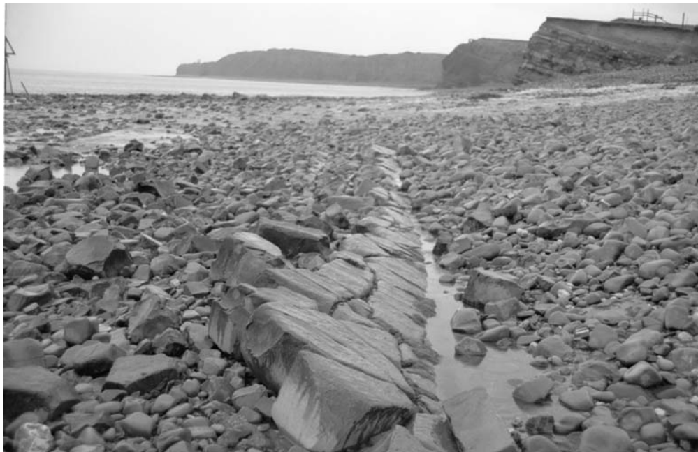
Figure 4.9: Cliffs and shore platform at Kilve, Somerset

Where the strata dip seawards, for example, west of Watchet and between Quantocks Head and Kilve, the lower cliff sometimes forms a sloping rampart formed by unbroken strata. On the platform, micro-cuestas are formed with the scarp facing landwards, and large accumulations of shingle and cobbles are retained on the landward side of the micro-cuestas. Most erosion of the scarps is achieved by wetting and drying processes; the erosional product is readily transported along the sloping micro-vales. The scarps are very effective in preventing shingle and cobbles moving down the slope of the platform towards the sea. Even where the scarp is no higher than 0.1 m, its alignment is clearly marked by the line of cobbles resting against it.