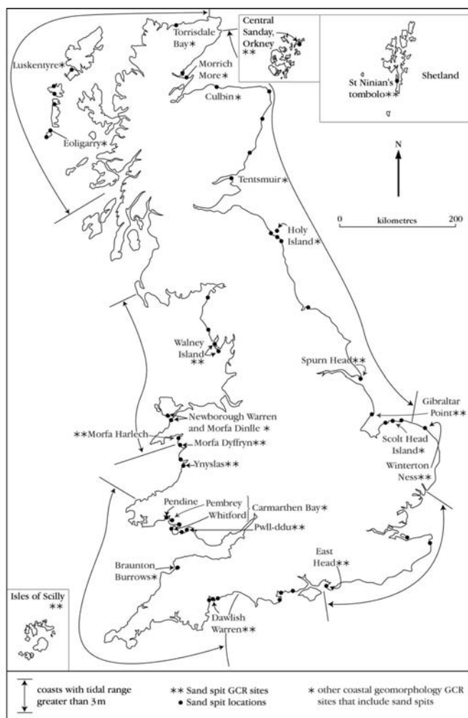
Figure 8.2: The location of sand spits in Great Britain, also indicating other coastal geomorphology GCR sites that contain sand spits in the assemblage. (Modified after Pethick, 1984).

The site extends from TG 489 216 in the north to TG 506 181 in the south. From a narrow dune ridge at its northern end, the ness widens to over 500 m in its central section around the ness itself before narrowing again southwards. North-east of the village of Winterton-on-Sea, the site is formed of linear dunes and slacks. Much of the dune landscape was greatly altered during the 1953 floods, and many of the blowthroughs and other features that existed before 1953 were modified or eliminated (Steers, 1964a). Ridges of shingle also occur, albeit occasionally. Towards the ness, low dunes rest upon parallel sand and shingle ridges about 1.0 to 1.3 m in height. South of the village, the old cliffline (which is up to 15 m in height) is separated from a line of dunes by a valley, the origins of which remain obscure.