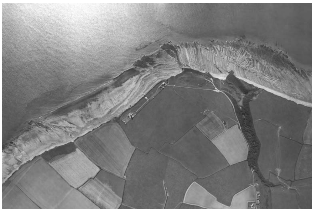
Figure 4.10: Nash Point, this view from directly above the site demonstrates the near-vertical nature of the cliffs and the width of platforms at low water. The micro-relief of the shore platforms is controlled largely by the relative strengths of alternating beds of limestone and argillaceous rocks and jointing patterns, on this photograph particularly noticeable in the vicinity of Nash Point itself (see also Figure 4.8b).

Nash Point has been described as an example of a site with structurally controlled platforms (Davies, 1972). Trenhaile (1969, 1971, 1972, 1974a,b, 1983) and Sunamura (1983) debated shore-platform development by reference to this and other British sites, and cliff and beach features were described by Williams and Davies (1987). A review of the literature suggests that the processes operating on this site have probably received more direct and regular attention than any other vertical cliff site in the UK (Mackintosh, 1868; Keatch, 1965; Trenhaile, 1969, 1971, 1972; Williams and Davies, 1984, 1987; Davies and Williams, 1986; Williams and Caldwell, 1988).