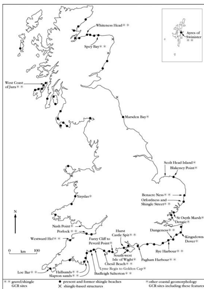
Figure 6.2: Coastal shingle and gravel structures around Britain, showing the location of the sites selected for the GCR specifically for gravel/shingle coast features, and some of the other larger gravel structures.

Benacre Ness (see Figure 6.2 for general location) is a good example of a ness formed in shingle and associated with rapid coastal retreat of part of the beach and of nearby cliffs. Williams (1956) outlined the history of the ness (which had been referred to by Ward (1922) under the name 'Covehithe Ness'), showing how it had progressively moved from south of Covehithe to its present-day position (see Figure 6.39); almost 6 km in 200 years. The site comprises three landform units: namely cliffs cut mainly in fluvio-glacial sand with a fringing beach of sand and shingle, a beach ridge fronting Benacre Broad and The Denes, and Benacre Ness itself, formed of sand and shingle ridges. Although the evidence from longshore sediment transport is that material moves towards the south, the ness form itself has moved northwards. As well as being a classic landform, therefore, Benacre Ness is of considerable importance for studies of coastal form-process dynamics (Steers, 1946b; Russell, 1956; Williams, 1956, 1960; Hardy, 1966; Cambers, 1975; McCave, 1978b; Carr, 1981; Onyett and Simmons, 1983).