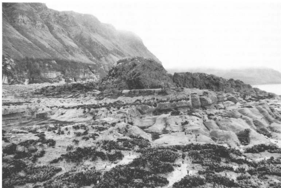
Figure 5.13: The Rubh' a 'Chromain composite sill exposed at the western edge of the Carsaig Bay site, Mull.

In detail, the intrusion cuts an earlier, irregular trachytic (bostonite) intrusion with a fine-grained, purplish-grey, aphyric appearance. Like the sill, the bostonite is xenolithic; a xenolith of black fossiliferous limestone has been tentatively assigned to the early Lias age, possibly related to the Broadford Beds (Lee and Bailey, 1925).