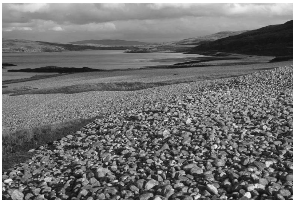
Figure 6.38: An unbroken 'staircase' of unvegetated emerged gravel beaches falls from c. 30 m OD to sea level on the West Coast of Jura. Looking eastwards towards Glenpatrick.

The lower suite of beach gravels is widespread throughout the west coast of Jura and falls in altitude from between 10 and 12.3 m OD to merge with the gravel ridges of the modern beach. Only a few distinct coastal terraces exist, but emerged gravel banks and beach accumulations