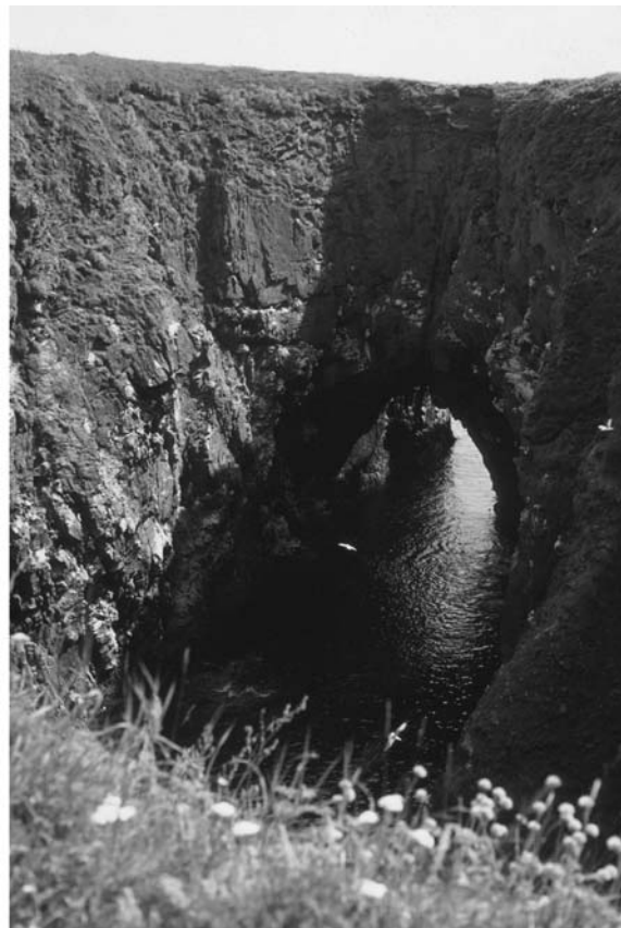
Figure 3.22: The Pot, Bullers of Buchan is a 60 m-deep enlarged blowhole connected to the sea by a 15 m-wide tunnel-like arch.

platform on its north side. Perhaps the best example of this is The Pot, where a deep rock-enclosed inlet is separated from the sea by a tunnel-like arch. The Pot resembles an enlarged blowhole and during storms this dramatic feature, which is c. 60 m deep and 15 m wide, is awash with a froth of white water as waves crash against the precipitous cliffs (Figure 3.22).