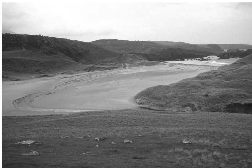
Figure 9.17: The central deflated surface of Mangersta viewed from the north-east. Climbing machair veneers the flanking slopes and occasional washover of the fronting beach occurs during storms.