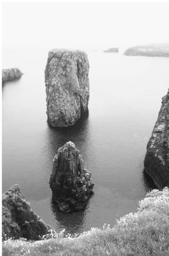
Figure 3.9: Fault-controlled stacks at Lamba Ness, Papa Stour.