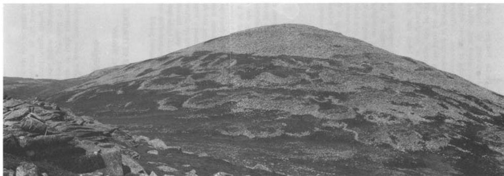
Figure 9.9: Summit blockfield, blockslopes and boulder lobes on the south-east flank of Cuidhe Crom, Lochnagar.

Shaw (1977) also made observations on present mass-movement activity in this area. Ploughing blocks are common on slopes of 9^{\circ} – 38^{\circ} ; these range from 0.39 m to 2.4 m in length, and movement is marked by furrows 0.13 m to 3.07 m long and turf banks that have been pushed downslope by as much as 0.83 m above the adjacent ground. Current rates of movement do not exceed a few millimetres per year. Shaw also documented several rockfalls from the Lochnagar corries, and described avalanche tracks 100 m and 180 m wide cutting through woods on the slopes north-west of Loch Muick. These terminate in fan-like avalanche tongues under the surface of the loch. The effects of recent snow avalanche activity in the north-east corrie of Lochnagar are relatively minor and restricted to occasional perched boulders, pits in the surface of talus and scratch marks (Ward, 1985b). Similar findings have been reported by Davison and Davison (1987) for an avalanche site in Glen Shee. Elsewhere, however, the geomorphological role of such avalanches is locally more important, for instance, in parts of the Cairngorms and on Ben Nevis (Ballantyne, 1989b; Luckman, 1992).