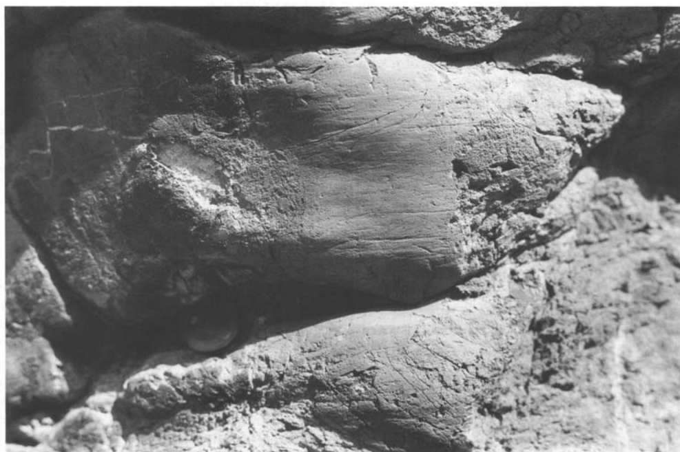
Figure 17.2: Part of the smoothed and grooved rock surface at Agassiz Rock, Edinburgh, which has been attributed to glacial abrasion. The form of the rock surface bears a strong resemblance to glacially abraded surfaces elsewhere in Scotland and in modern glacial environments.

The striations at Agassiz Rock from part of a local assemblage of features that indicate ice moving eastwards across the area (Figure 17.3). Blackford Hill itself is a crag and tail, 1.5 km long, with deep erosional grooves on both its north and south sides, comparable to those around Edinburgh Castle Rock (Sissons, 1971). A smaller superimposed crag and tail occurs at Corbie's Craig south of the hill top, and to the east, clast fabric measurements in the main drift tail also conform with ice flowing to the east (Kirby, 1969b).