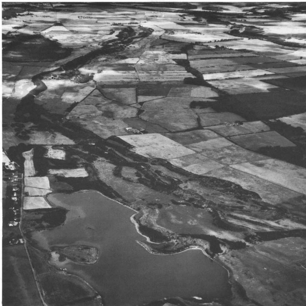
Figure 7.12: The Kildrummie Kames esker system viewed towards the east. Two areas of braided ridges (right foreground and centre distance) are linked by a single ridge.