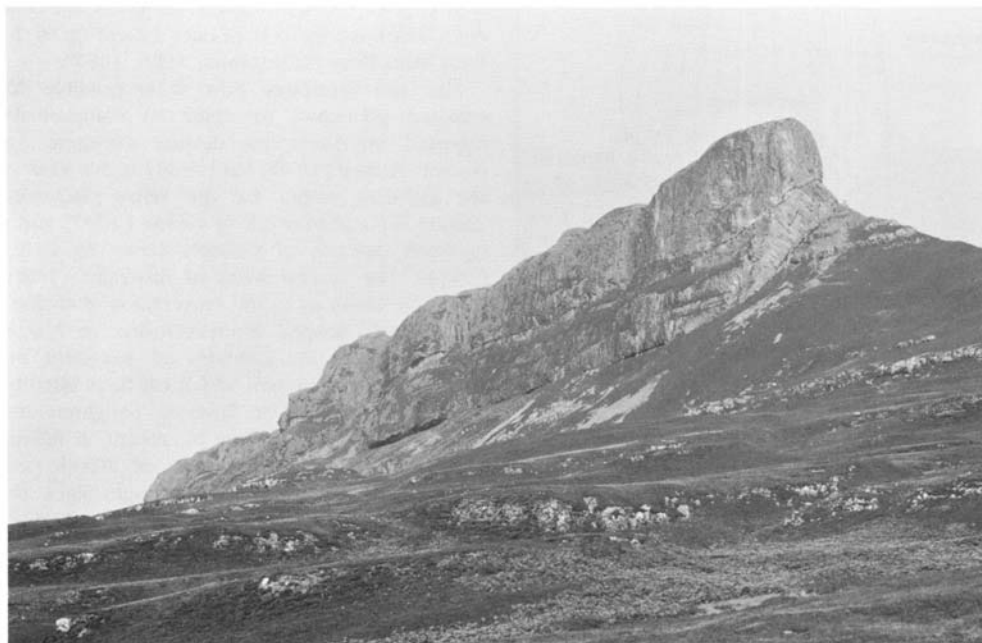
Figure 3.16: Ridge of the Sgùrr of Eigg, formed by an Eocene pitchstone flow filling a valley eroded from Palaeocene basalt lavas. South-west Eigg site.

On Eigg, the basaltic lavas show slight differences from those on Skye, but vary little in detail from those on Mull. The most striking and controversial geological feature is the relatively young pitchstone forming An Sgurr and adjoining hills. Geikie (1897) regarded the pitchstone as a subaerial lava flow which had occupied a system of small river valleys eroded into the underlying lavas, but Harker (1908) reinterpreted it as an intrusion. Bailey (1914) subsequently supported Geikie's view but invoked auto-intrusion to explain some features. Ridley (1973) supplied new mineralogical and geochemical data from both An Sgurr and the earlier lavas but remained uncommitted as to the nature of the pitchstone. Recent research, however, favours an extrusive origin for the Sgurr pitchstone (Allwright and Hudson, 1982).