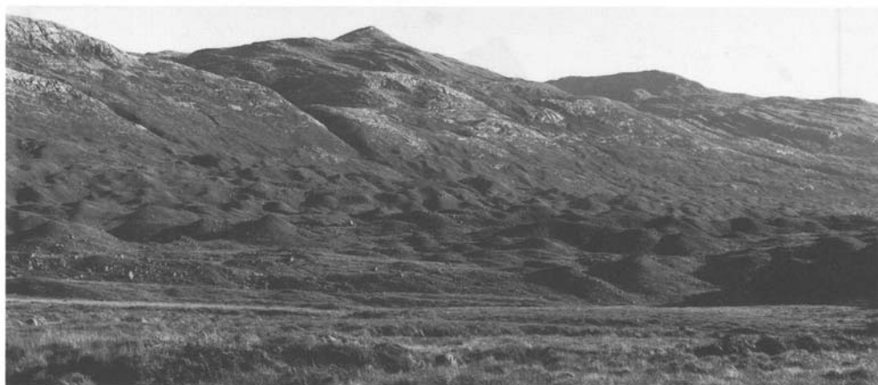
Figure 6.14: Hummocky moraine at Coire a'Cheud-chnoic in Glen Torridon. A clear drift limit on the valley side demarcates the Loch Lomond Readvance deposits below from the ice-scoured bedrock slopes above.

Constituent materials of the hummocky moraine are revealed in a recent roadside quarry at NG 954567. The section shows till at the bottom, consisting of angular clasts and boulders in a sandy and gritty matrix. Its upper surface is deformed, and an overturned fold partly encloses a large lense of poorly bedded sands and gravels. Above, layers of sands and gravels form the core of the upper section of the mound. The depression adjacent to it is underlain by a semicircular lens of angular clasts in a gravel and grit matrix, and is capped by a layer of poorly sorted sands and gravels. It is not possible to assess how representative this section is